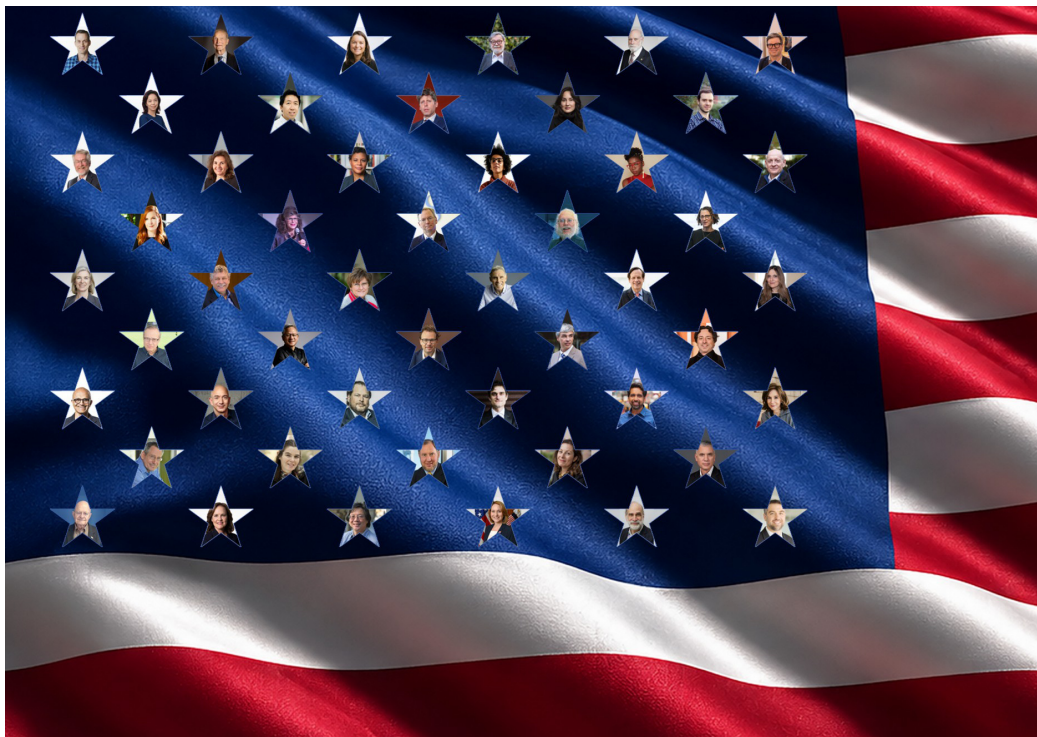
Fifty stars for fifty states. Fifty Pioneers for a new age of humanity.