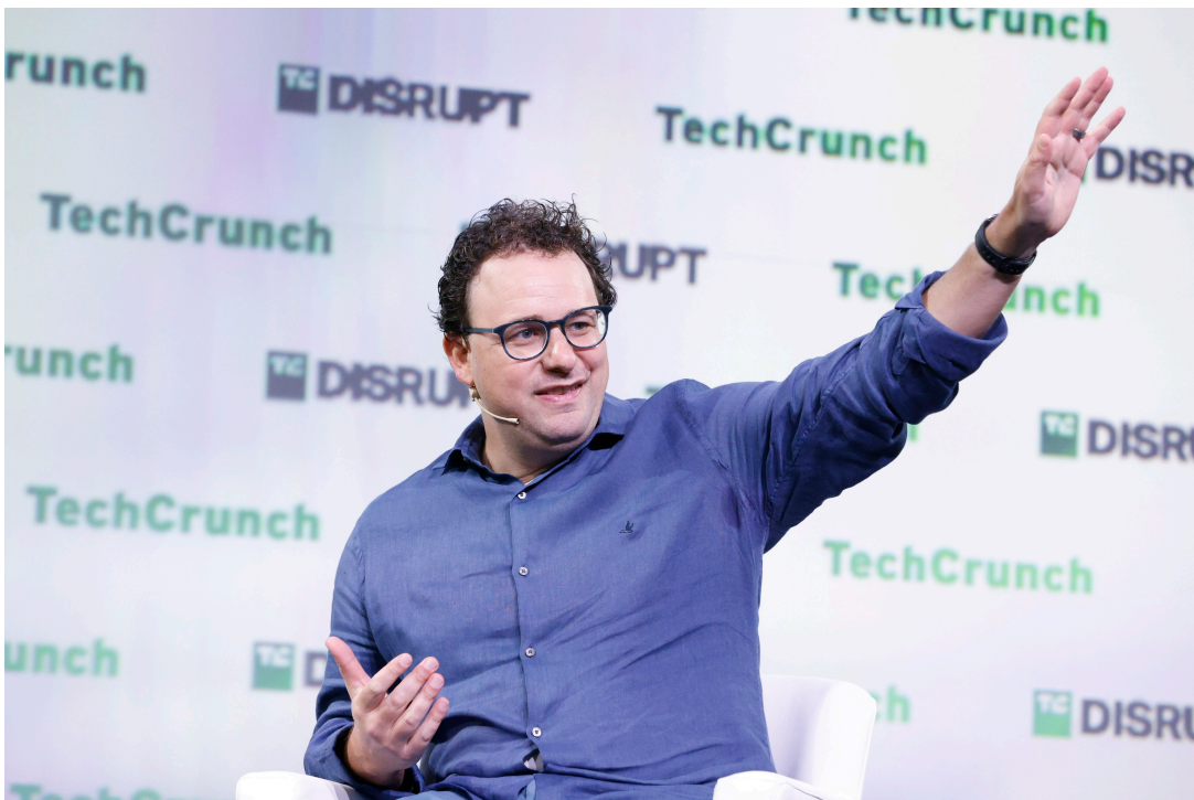
Dario Amodei, Co-Founder and CEO of Anthropic, honored among the America 250: AI Pioneers · TechCrunch Disrupt 2023