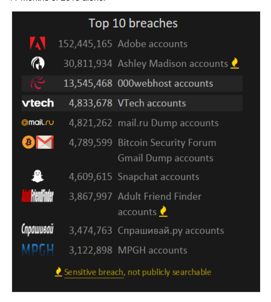
Figure 1: Hacked personally-identifiable information (PII), as of November 28, 2015.5

was Adobe in 2013, which lost 152 million emails and passwords.<sup>2</sup> This year, Ashley Madison (the website for people seeking affairs) lost 37 million accounts, which were made publicly available. This was likely from an insider attack by hactivists -- activists that use hacking as a tool.<sup>3</sup> These figures can be corroborated from other sources, and may understate the problem. According to MicroSoft, 160 million consumer records were compromised by hacking in the first 11 months of 2015 alone.<sup>4</sup>